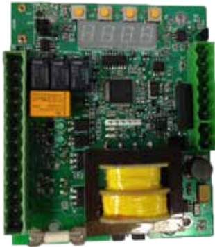
ACT100 120/240 VAC Actuators